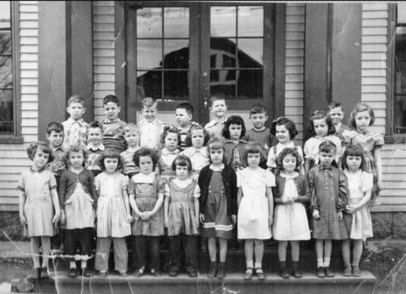
Bradley, Maine Kindergarten Class 1952