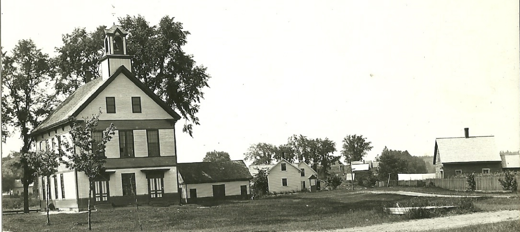
SCHOOL HOUSE. BRADLEY N.J. III.