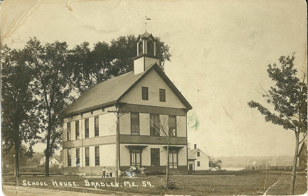
SCHOOL HOUSE. BRADLEY, ME. 59.